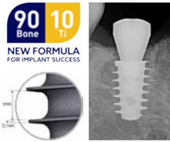
"Bone Bending" Technology!

"The hands on mentoring is priceless!..it gave me the confidence to provide these services to my patients. The mentor was available at all phases of treatment and that put my mind at ease. Best and only way I recommend anyone to incorporate implant services in their practice!"