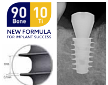
"Bone Bending" Technology!

"The hands on mentoring is priceless!..it gave me the confidence to provide these services to my patients. The mentor was available at all phases of treatment and that put my mind at ease. Best and only way I recommend anyone to incorporate implant services in their practice!"